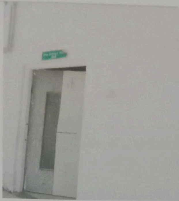
Girls common Room