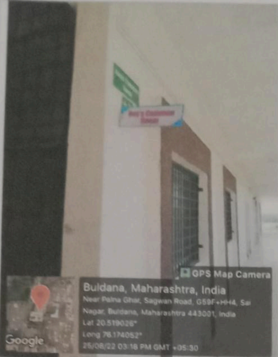
Boy's Common Room